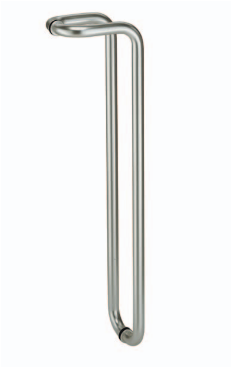
Illustration: right hand, outside view

Handle cross-section \varnothing 35 mm Safety clearance S = 47 mm Fastening M8