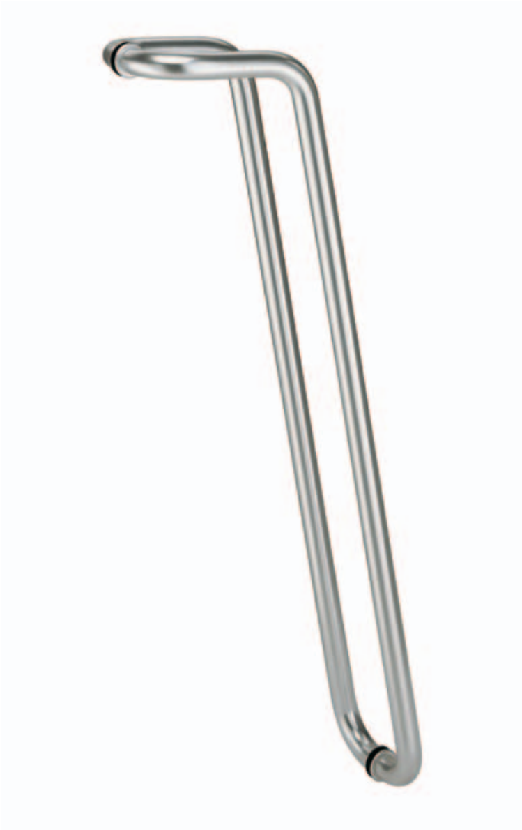
Illustration: right hand, outside view

Handle cross-section \varnothing 35 mm Safety clearance S = 47 mm Fastening M8